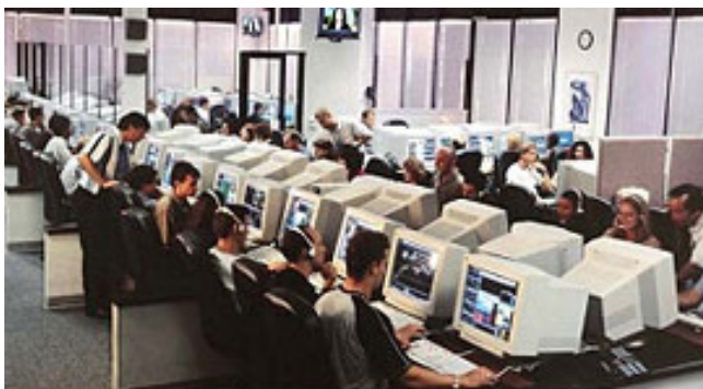
OTA 1997 Trading Floor

The Online Trading Academy recognized this problem. They had a fantastic idea to ask their successful traders if they would help the inexperienced ones. They set up classes so the newbie traders could learn the different trading styles techniques and habits from the successful traders. It was a tremendous success. They knew they were on the right path. They found that more and more of their traders were making money and unlike their competitors who were continually losing traders there trading floor was bursting at the seams. As time went on, the Online Trading Academy refined their training techniques and set up formal classrooms. These classrooms were